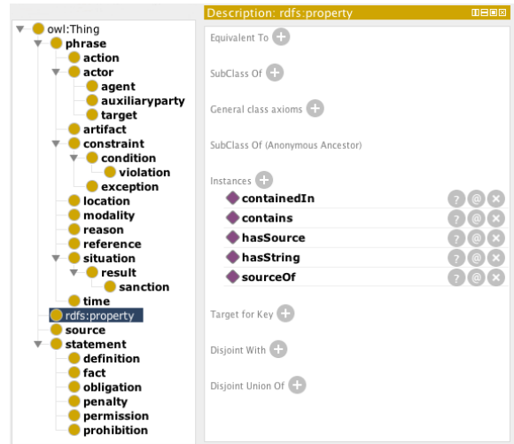
Fig. 3. The RDF Schema in Protégé

subsequently processed in order to automatically extract semantic metadata for the statement itself as well as the phrases contained therein. The metadata annotations produced in this step follow the conceptual model developed in our previous work and shown in Fig. 2. In this paper, we do not elaborate further on the conceptual model; the reader can find definitions, examples and discussions in our prior work.