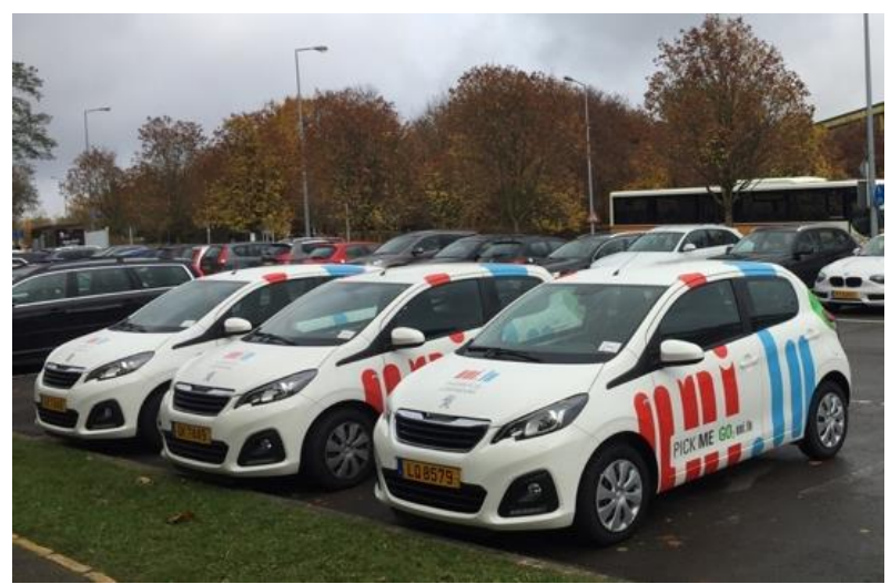
Figure 1: corporate car sharing fleet located in Campus Kirchberg

These cars are mainly offered to the staff for any type of professional out-of-office activity, including intercampus connectivity. The university is in fact consisting of four campuses, three of which are in Luxembourg City, while the newest and biggest campus is located in the City of Sciences/Belval (around 25 km from the capital), one of the new activity poles established by the government in the south of the country. One of the main reasons supporting the adoption of corporate car sharing is that the university expects to improve the accessibility of the new campus especially considering that in this newly developed area the public transport offer is not yet fully deployed. In turn, the expectation is that the existence of this alternative may have a positive influence to the mode chosen for commuting. For the same reasons, apart from the corporate cars, the university also launched a shuttle service (mainly for use by the students), which connects the campuses each hour between 8AM till 19PM, and a carpooling platform. We focus however only on the car-sharing system, leaving a more comprehensive multimodal study to the future.