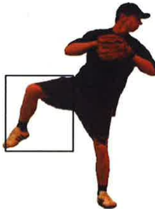
Figure 2. Photo number 3 in the EDT which shows the movement error „supporting leg is elevated“.

An example of movement errors presented in EDT is shown in Fig. 2.