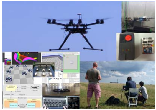
Figure 2: From simulation to field test

As in Figure 2, this use-case will be demonstrated on the "smart parachute", a remote termination add-on component improving safety of UAS [Ci16] developed in partnership with the company Alérion. The parachute is controlled by a CPAL program, on top of the bare-metal interpreter, executing on a Freescale FRDM-K64F board.