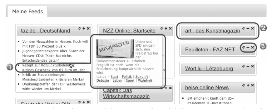
Figure 3: With CUBA (www.cuba.lu) to foster on Illich's concept of conviviality. (1) shows a preview of a message, whereas (2) points to a currently closed channel. In (3), possible actions for a feed are presented, which are – from left to right – check for new feed entries, open/close a channel, and remove a channel from subscription.