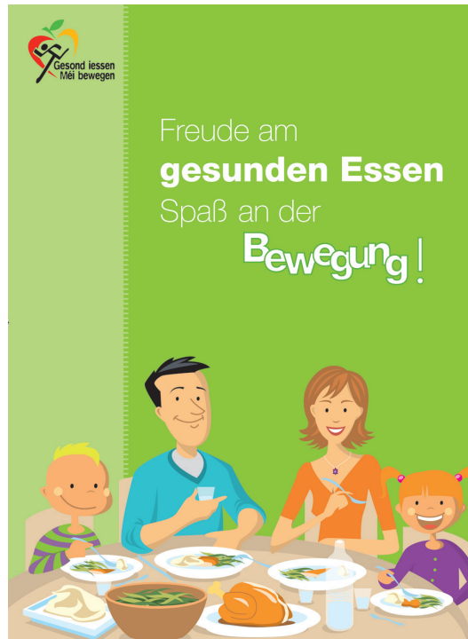
Figure 2: Cover page of the pamphlet “Freude am gesunden Essen. Spaß an der Bewegung!/Le plaisir de bien manger et d’être actif!” (2007 edition) (Enjoying healthy food, enjoying exercise).

Notwithstanding the pamphlet’s serious contextual foil – which points out the statistical correlation between poor nutrition and insufficient exercise with the diseases of civilisation, health insurance costs and death rates, making “urgent action necessary” (page 1) – the authors have endeavoured to keep the tone playfully positive and encouraging. The pamphlet’s summery-fresh colours and amusing illustrations emphasise this additionally. On the whole, the recommendations are formulated in a positive manner, e.g., “consume milk and dairy products every day” (page 5), etc. Wherever it is not possible to rephrase the negative aspects of a message, an alternative is offered, e.g. “limit the consumption of fatty food. Use vegetable fats in preference to animal fats” (page 4). Thus rather than some foods being “forbidden”, value is placed on variety and food intake based on the nutrition pyramid, i.e., based ultimately on the assumptions of dietetics 53 .